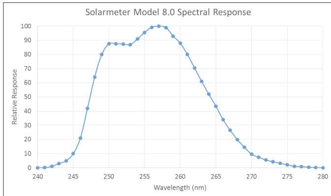
Fig. 1. Model 8.0-RP Spectral Response

Note: Sensor is completely solar blind to UVB, UVA, visible and IR. Meter will read 000 pointing at non UVC sources including sun, flood lamps etc.